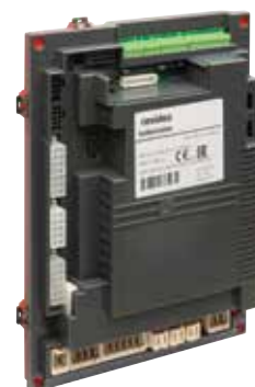
maXsys III boiler control