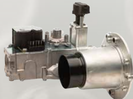
Rambler gas valve with motor driven throttle and venturi