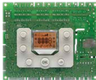
Heat pump controls

Resideo is offering heat pump controls for mono block/ split and hybrid types of appliances to meet high energy efficiency and performance requirements. Resideo controls can provide a complete solution firstly for