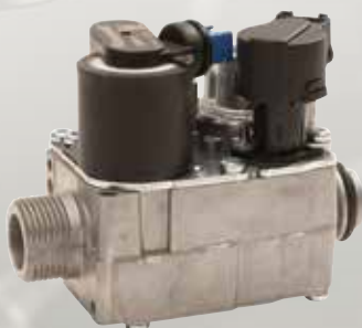
PX52 gas valve