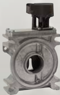
Motor driven throttle