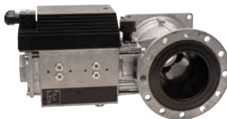
CG2 gas valve with throttle and VLS venturi